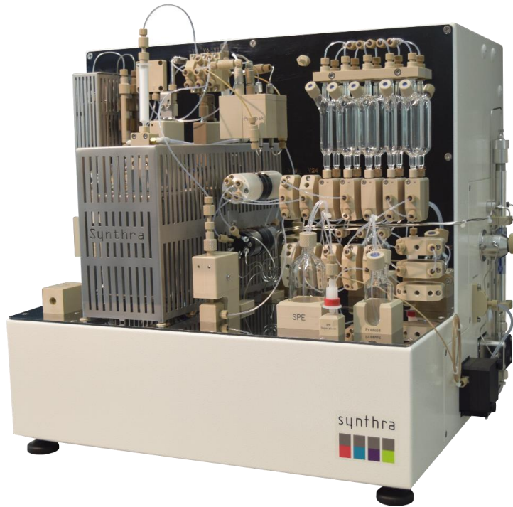
Synthra MeIplus reaction loop