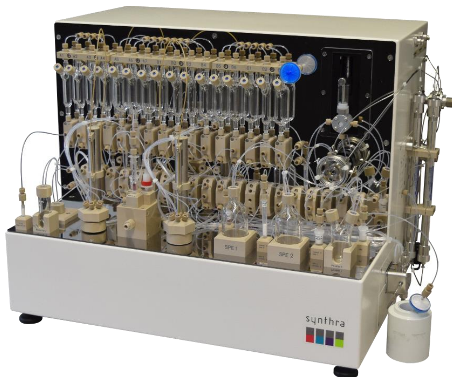
Synthra RNplus Research Research